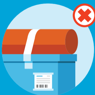
Uneven parcels, tied together

Here are examples of parcels that cannot be machine-sorted and are subject to a fee because they are processed more manually: