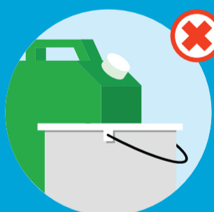
Containers and buckets