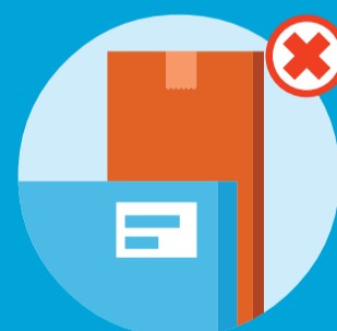
Parcels over 115 cm in length and/or over 60 x 60 cm