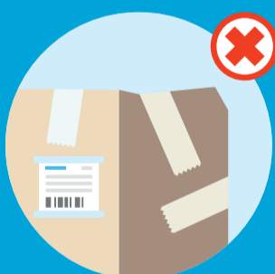
Poorly packaged parcels that could otherwise be machine-sorted