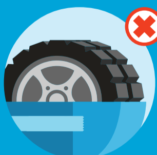
Tires and rims