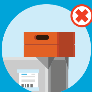
Metal, plastic and wooden boxes